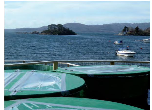
Fig.1: Mesocosm set up at Espegrend, Norway.

Hence, we intended to address ocean acidification effects in Atlantic cod, a key fish species which is heavily exploited in the entire northern Atlantic. Experiments were performed in large land-based outdoor mesocosms (Fig. 1) under natural temperature, salinity and light conditions near Bergen, Norway using natural plankton from the nearby fjord as food for the larvae. The Atlantic cod is widely distributed along the entire North Atlantic coast. It matures at 3 – 5 years. Its reproduction is characterized by high fecundity with an average of 1 million eggs per female and fluctua-