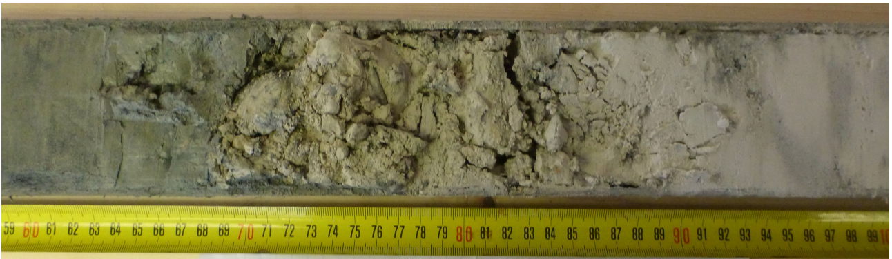
Figure 2: The transition from glauconitic sandy-mud to chalk in 70 cm subbottom depth. The indurated part forms a depositional hiatus.

Everyone on board is doing well despite some significant swell. Best regards on behalf of all cruise participants,