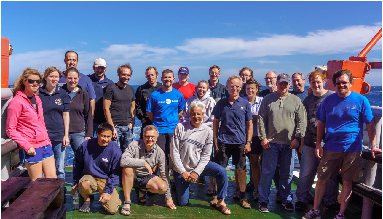
Figure 2: The Science team onboard RV SONNE cruise SO226-2 CHRIMP.

deployed the multicorer 46 times, the piston corer 39 times and almost all deployments were successful. The geochemists onboard ended up with more than 7000 individual samples to process and like all other groups (Fig. 2) will return with a wealth of interesting data that have to be processed and interpreted in the upcoming months.