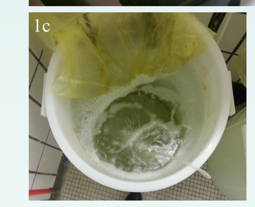
Fig.1 (a-c) Copepod and food cultures. 1(a) Pyrenomonas salina cultures bubbled with different CO<sub>2</sub> concentrations 1(b) Chemostats of the backup algae cultures 1(c) Aeration system of the copepod tanks