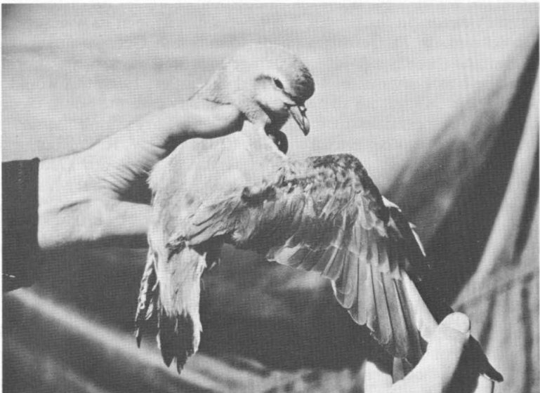
Fig. 3. Breeding fairy prion Pachyptila turtur caught at Bird Island.

This species was first recorded at South Georgia between 30 March and 10 April 1977 when four specimens were captured aboard the RV Hero while at anchor at Elsehul (Jehl and others, 1978). In the same year unidentified prions were seen flying and behaving in a manner unlike dove prions below the north-facing cliffs on Bird Island. In 1981 breeding was confirmed when a small population was found by P. A. Prince in Prince Cove, Bird Island (Fig. 3). The birds breed under large