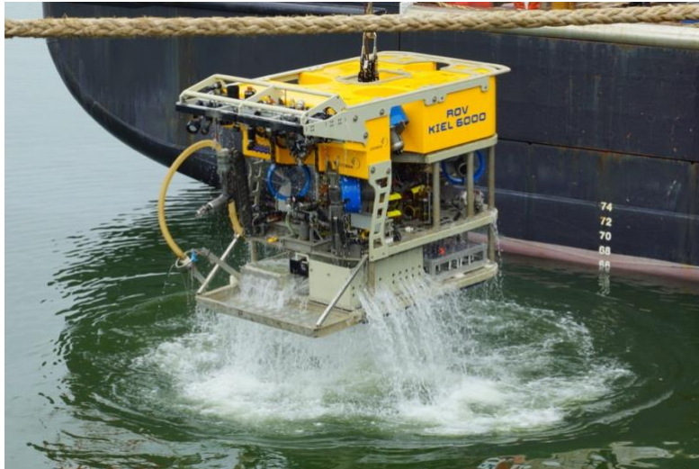
Fig. 3: Test dive of the remotely operated vehicle ROV Kiel 6000 carried out in the port of Guayaquil (CONTECTON-terminal, mooring 6). The ROV will be used to recover the GeoSEA Array during cruise SO288.

On Saturday the 15. of January 2022 at around 13:00h, the RV SONNE left the CONTECTON-Terminal of Guayaquil port in Ecuador (02°16'S/79°54'W). The port was left after the result of an extensive PCR-screening, which took place the previous day, came back all negative. Further PCR screening is scheduled to take place after a few days at sea. The incipient journey follows the south American coastline down to our study area offshore northern Chile. A first safety briefing was already carried out during the passage of the Rio Guayas.