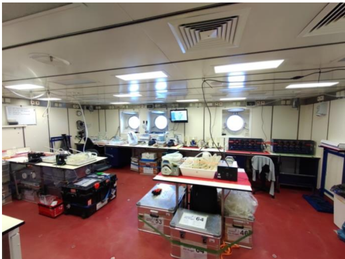
Fig. 2: Installation of the biochemical lab.