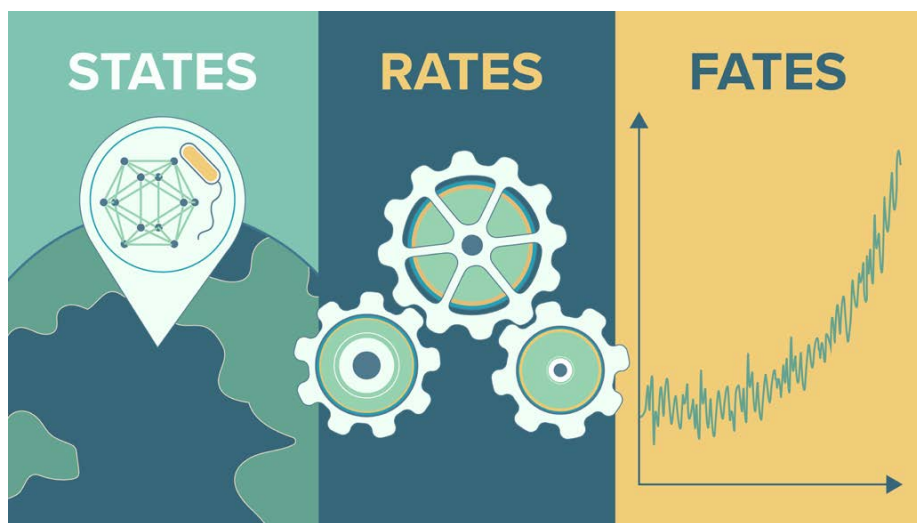
FIGURE 2. A schematic from the recent 2023 Science Planning Workshop held in Woods Hole, Massachusetts, USA. The States, Rates, and Fates themes will correspond to major sections of the Science Plan outline.

Thanks to the continued efforts of scientists from many nations, BioGeoSCAPES program development is well underway, with the goal of launching by the mid-2020s. While work remains to complete the science plan, build infrastructure and data management capabilities, inspire the next generation of leaders, and expand an already thriving scientific network across nations and disciplines, the continued strong community engagement clearly demonstrates a commitment to the scientific goals. The interdisciplinary investigation of how the states, rates, and fates of a diverse range of ocean biomes operate will catalyze new discoveries and reveal the mechanistic underpinnings of Earth’s life support system. Together these advances will help our species understand and predict how the ocean’s “biogeoscapes,” and their intertwined microbial and elemental cycles, are changing.