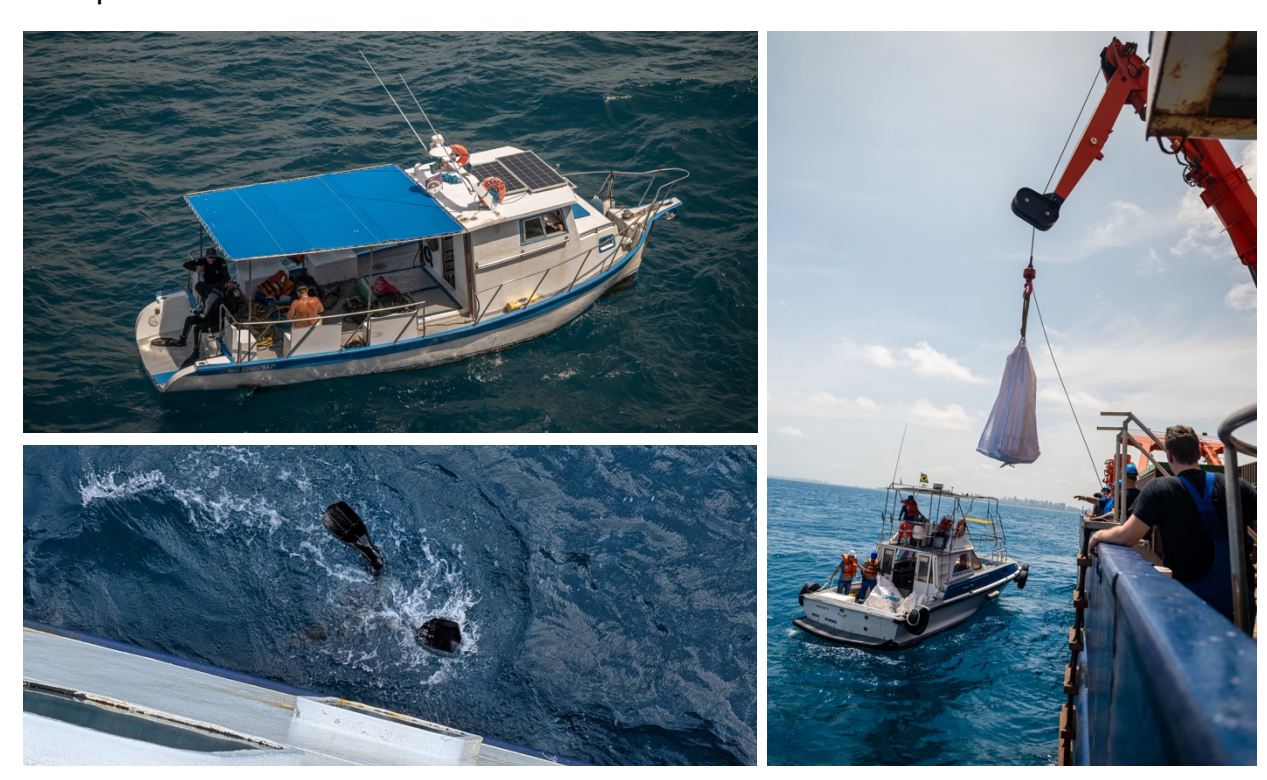
Fig. 1: Top left: The diver gets ready for action. Bottom left: The diving operation begins. Right: Taking up provisions.

The journey south from Belém was not just a transit to the M207 working area. Instead of continuing south past Recife as originally planned, we made a short stopover outside of the port of Recife so that a diving operation could take place. During the previous research cruise, a defect had occurred in the moon pool that needed to be repaired and as the water off Belém is turbid, the repair needed to take place off Recife. The requested diver came on board in the morning of January 9, 2025 and had the crew explain the necessary repair work to him. As the crew had already prepared this operation very well in advance, the work progressed very quickly and we were able to continue our transit to the working area in the afternoon, after we had also taken some fresh provisions on board.