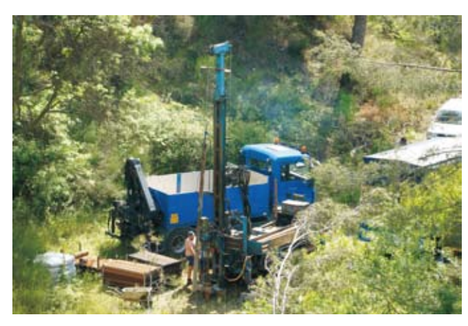
Figure 2. Drilling operations at section LB1 with a trailer-mounted rig.

The regional and palaeogeographic setting of the stratotype is that of an intrashelf basin—the South Provence Trough—that formed within the Urgonian Carbonate Platform during late Barremian times (Masse et al., 1993). It was isolated from the Vocontian Basin to the north by the North Provence Platform (Monts de Vaucluse – Mont Ventoux) and bounded to the southeast by the South Provence Platform (Mont Faron). Although quite restricted in extent initially, this trough extended westward during Lower Aptian times to join the North Pyrenean Basin of the