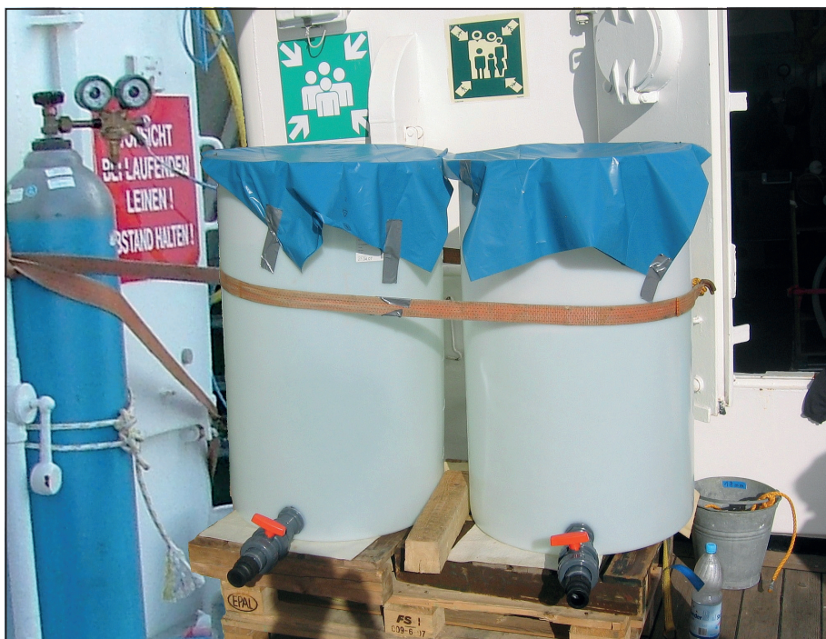
Figure 2.1 Aeration system for seawater carbon dioxide ( \text{CO}_2 ) enrichment consisting of a bottle of pure \text{CO}_2 gas and two 250 l seawater containers.