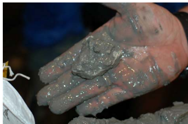
Fig. 2: "Boiling" water indicating the presence of gas hydrates in a box corer sample. Ten minutes after taken on board gas hydrates of substantial size were picked from the mud.