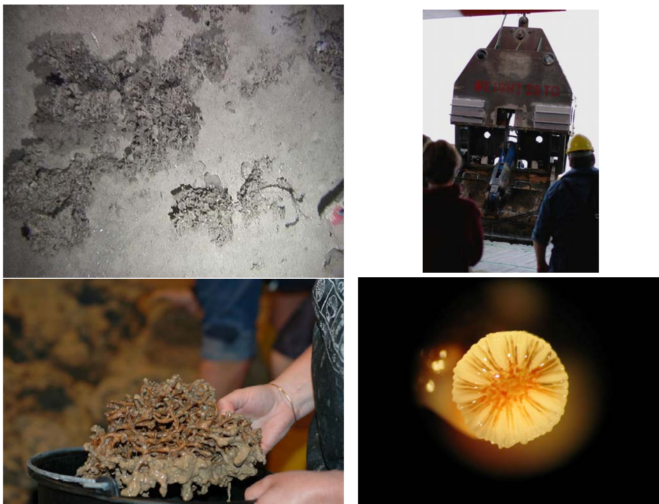
Fig. 4: Coral reefs at the base of Captain Arutyunov MV; sampling with the large volume TV-grab; close up of a living stone coral ( Caryiophyllia sp.).

The finding of living reef building cold water corals at CAMV was another highlight of the last week. Patches of corals were observed around the 1400m depth contour at the base of CAMV in several OFOS surveys. Many of them were partly buried or nearly covered with sediment, but we still found living specimens on larger reef structures. Due to the extraordinary manoeuvrability of M. S. MERIAN we were able to sample such a structure with the large TV grab and prove for the first time the existence of living coral patches in such water depth in the Gulf of Cadiz (Fig. 4).