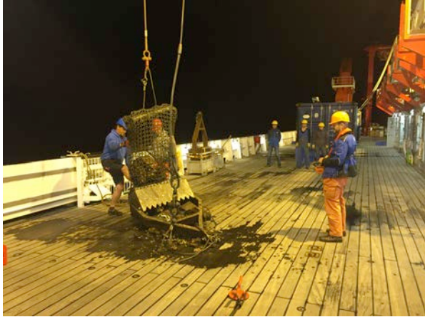
Emptying one of the last dredges of the cruise also required a bit of footwork.