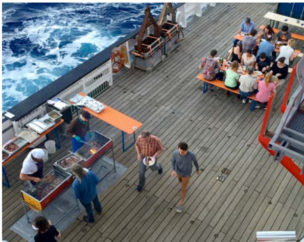
Grilling on deck to celebrate the end of a successful cruise, several birthdays and one of the crew's last voyages before retiring.