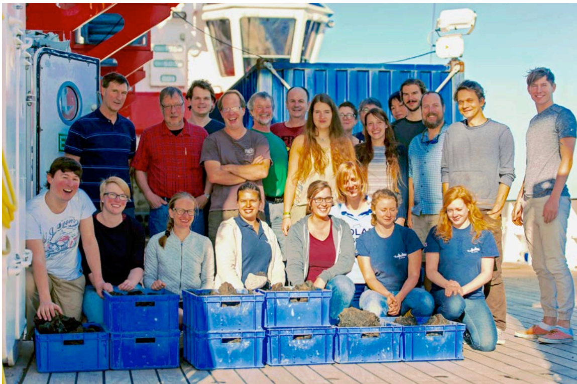
SO255 scientific crew: Can you guess who missed the photo shoot and had to photoshop herself into the picture?