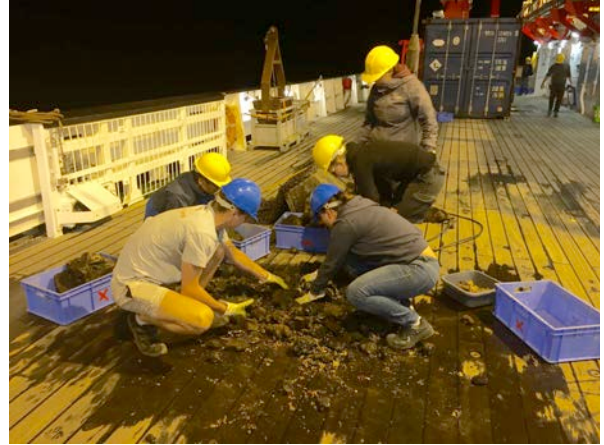
Scientists on the night shift loading the samples into boxes for sawing and describing in the lab.