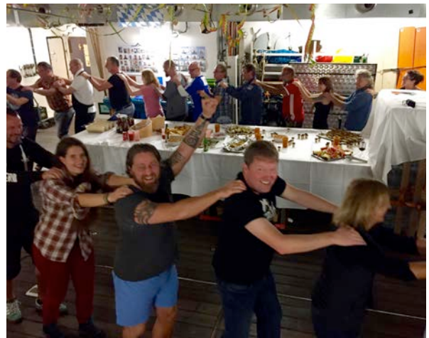
Our five star cook enjoying the party after making sure that everyone got more than enough to eat.