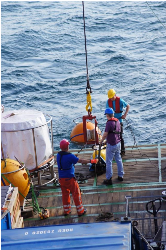
Deployment of moored profiler, a CTD and velocity profiler that crawls vertically along a mooring wire.

While the BIGO landers are deployed, microbial nutrient and trace metal cycling rates are determined in different depths of the water column above the deployment positions. The water column cycling rates are determined by incubations with ^{15}\text{N} , ^{13}\text{C} and ^{18}\text{O} labelled compounds and by genetic analysis to identify different microbial strains and to quantify their activity. The water column cycling rates are determined by colleagues from the Max-Planck Institute for Marine Microbiology in Bremen.