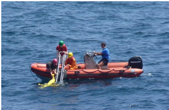
Glider deployment on the 12°S section

The work program during the second week of the cruise was completed successfully. The process study investigating fronts and filaments in the southern working area at 14°S ended on Monday. Also, a drifting sediment trap at 14°S deployed during the first week of the cruise was recovered. During the transit to the main working area at 12°S we recovered two gliders. Due to their real-time data transmission capabilities, they helped the identifying fronts and filaments for the process study. Now they are