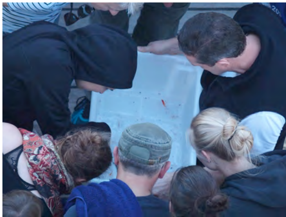
Biologists and geologists have a first look at the outcome of the first trawl.

On June 10th, two more trawls were carried out approximately 500 nautical miles (nm) off the west coast of Australia. To avoid previous problems, the net was deployed open this time and was initially lowered to 700 m depth and then raised in steps of 50 m every 30 minutes. After 3 to 5 hours the net was recovered on deck. Both catches were highly successful and yielded different and rare species of fish, squid, octopus and shrimp. The last trawl was brought in after sunset, avoiding bleaching of the fish and shrimp eyes in order to allow biochemical and physiological experiments on the visual systems. In addition, samples from many different species were collected and preserved for molecular-biological, and morphological work in the respective home labs.