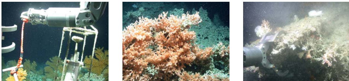
Fig. 1 upper: Map of the Celtic continental slope and the four work areas during leg M61/3 lower (l): recovery of currentmeters with QUEST manipulator at Galway Mound (m) Lophelia sp. colony at Franken Mound (r) sampling carbonate crusts at Connaught Mound

mound surface could be performed at this site between June 11 th and 13 th , including extensive sediment surface and gravity core sampling, CTD casts and 4 complementary ROV dives. Result of this station work is a complimentary dataset of oceanography, detailed in-situ observations, mapped surface structure extensions and a large variety of sediment and surface samples. Due to changing weather conditions we decided to spend the remaining time not in