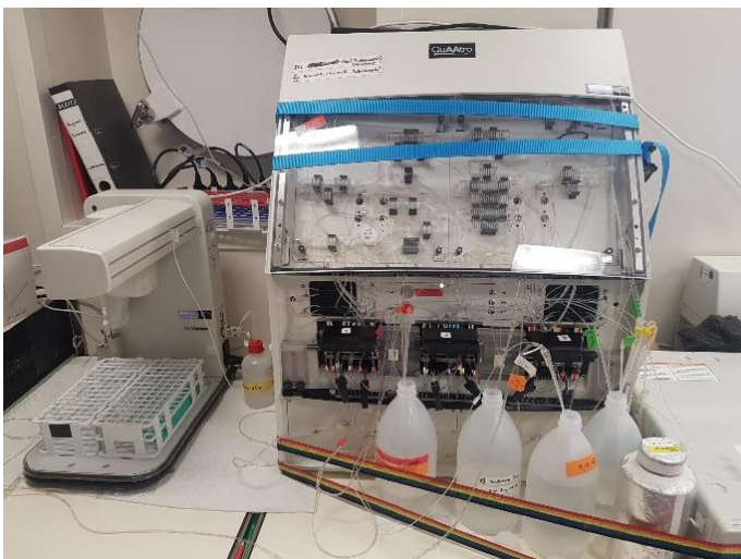
QuAatro39 segmented flow analyzer for the analysis of nutrients onboard.

Onboard, the concentrations of nutrients such as nitrate, ammonia and phosphate are measured simultaneously in the pore water using a Seal Analytical QuAatro39 segmented flow analyzer. While ammonia and phosphate are released during the degradation of organic matter, nitrate is consumed in oxygen-free sediments. Therefore, the determination of nutrients further allows for the characterization and quantification of biogeochemical processes in the sediments.