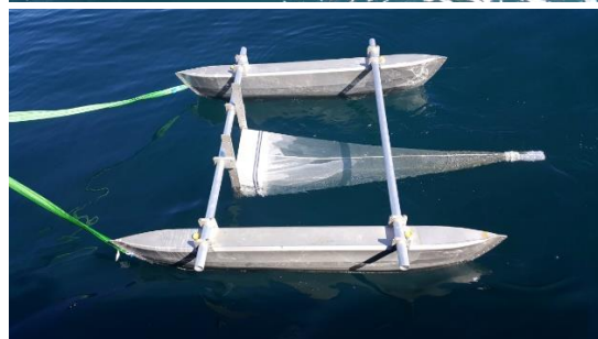
Figure 4. (Left) WP3 net being retrieved and rinsed. (Right, top) Bongo net being deployed. (Right, bottom) Catamaran trawl during sampling.

We have also started performing visual litter surveys during transits between stations. These litter surveys follow protocols from colleagues at the Alfred Wegener Institute for Polar and Marine Research (AWI), and will be shared for integration into their global litter database. We consistently see numerous floating macroplastic objects every hour during transit. These may be a source of some of the microplastics we sample in the water column and sediments.