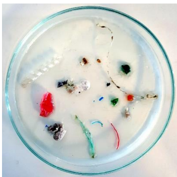
Figure 5. Floating plastic objects sampled by the catamaran trawl. The petri dish diameter is 8 cm.

Most of the samples collected during AL534-2 cannot be analyzed on board ship, so results will mostly follow post-cruise laboratory work. Qualitatively, we have seen few visible microplastics in our samples. The only exception was one of our three catamaran trawls, which crossed an accumulation zone formed at the sea surface by Langmuir circulation. That trawl sample contained many micro/meso-plastic objects (Fig. 5). The identifiable objects appear to derive from fishing line, synthetic rope, foam, and pellets.