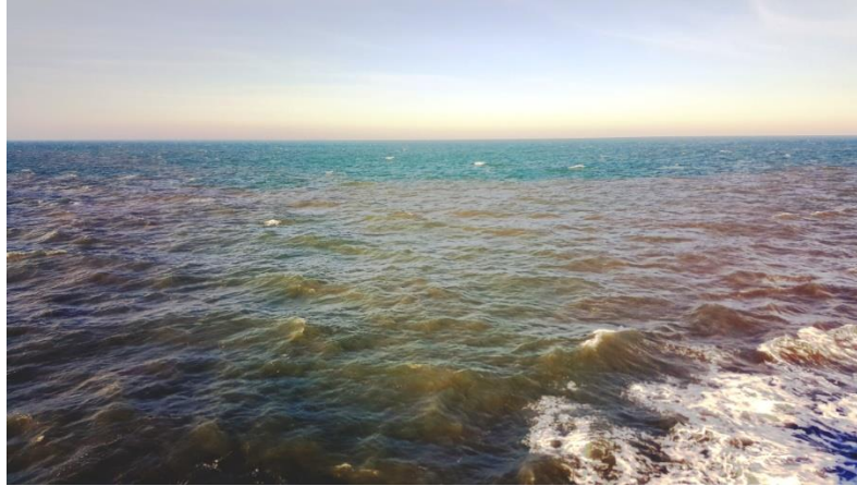
Figure 2. Color difference between the turbid Elbe River plume and the bluer North Sea water.

On Wednesday the 25 th , we transited to the Ems River at the border of Germany and the Netherlands. We took advantage of the time before high tide to sample a station farther offshore for gelatinous zooplankton (Station 14; Fig. 1). We only did a CTD cast and WP3 net tows, to investigate if the jellyfish community would be as abundant as we observed off of Helgoland the previous day.