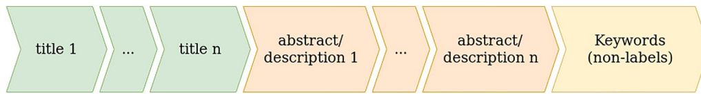
Figure 2. Concatenation of the payload parts.

were filtered out as duplicates. The high number of duplicates can be explained by the occurrence of DOI-versioning 21 , which is the publication of several versions of a research data item under different DOIs and one “concept DOI,” which maintains references to the different versions. As a result, a lot of payloads are identical if the title, description and subject tags do not change over versions.