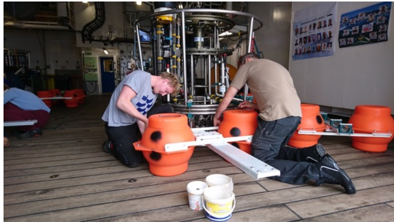
Preparation of mooring instruments

We do not only make use of the instruments on board but also use satellite data to be informed about phenomena ahead of us. For example, measurements with the CTD can then be carried out on site. These phenomena include oceanic eddies, which are large rotating water masses.