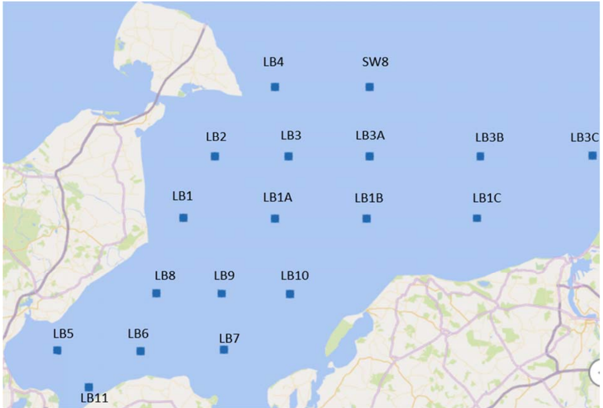
Fig. 2: Station grid in the Lübecker Bight / Mecklenburger Bight which was conducted due to heavy weather conditions in Northern and Eastern parts of the Baltic Sea, which made a change in the cruise plan necessary.