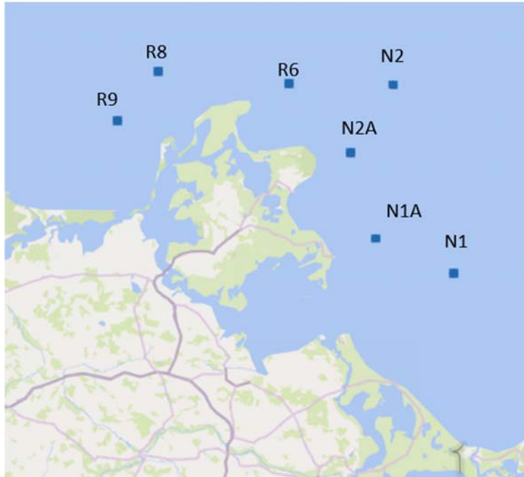
Fig. 1: Investigation area in the eastern part of the German Baltic Sea coast around Rügen.

Leaving Bornholm Basin at 22:30 to finish the high resolution investigation of the German Baltic Sea coast for gelatinous macrozooplankton and ichthyoplankton – east of Rügen (Fig. 3).