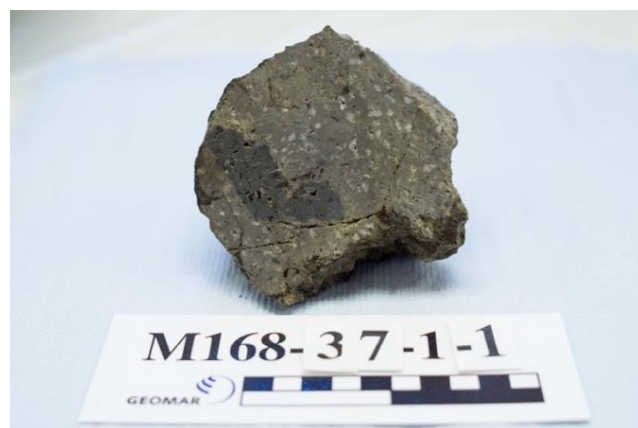
Left: Half full dredge from a dredge haul at the seamounts west of King's Trough. Some rocks are so large that it was a challenge to get them out of the chain bag. Top: Volcanic rock from one of the seamounts showing a mixture of two different magmas: a felsic (bright area) and a mafic (dark area) (pictures: Antje Dürkefälden, Fabian Hampel).