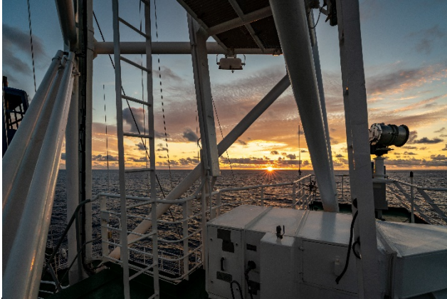
Fig. 2: Sun setting on METEOR.

We already see very nice clear Th isotope signals in the plume, indicating scavenging processes.