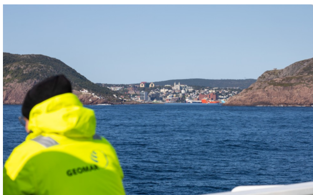
Figure 1: The entrance to harbor of St. John's (Newfoundland), protected by rock formations, is a spectacular sight.

At the beginning of last week, shortly before arriving in Newfoundland, we were hit by a small but powerful low pressure area. In waves of up to 7 m, the Merian rolled heavily and tilts reaching up to 20° tested our lashings and secured devices in the laboratories. However, since we had all checked them the evening before, there was no damage. Starting the next day, the weather could not have been more different during a short stopover in St. John's (Newfoundland) and during the subsequent transit through St. Lorenz Bay. In bright sunshine and summer temperatures, we arrived in the port of Charlottetown (Prince Edward Island – PEI) on September 23 rd , finally reaching our working area after eleven days of transit.