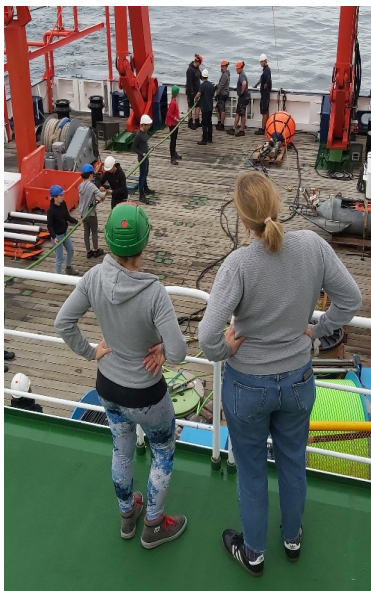
Figure 3: Deployment of the seismic streamer.

After the subsequent deployment of the 2D seismic streamer, we have started measurements along a more than 800 km long profile that will cover most of the wells known to us in the area to the N of the PEI. Currently we have already finished about 300km of the profile.