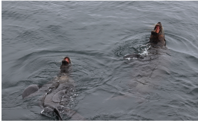
Fig. 2: Greeted by sea lions at the site of our second filament study.

At each of the daily stations located within the centre of the filament we are conducting a deployment with so-called in-situ pumps. These are devices that are lowered into the water to specific depths, which then pump high volumes (1000-2000 L) of seawater through a