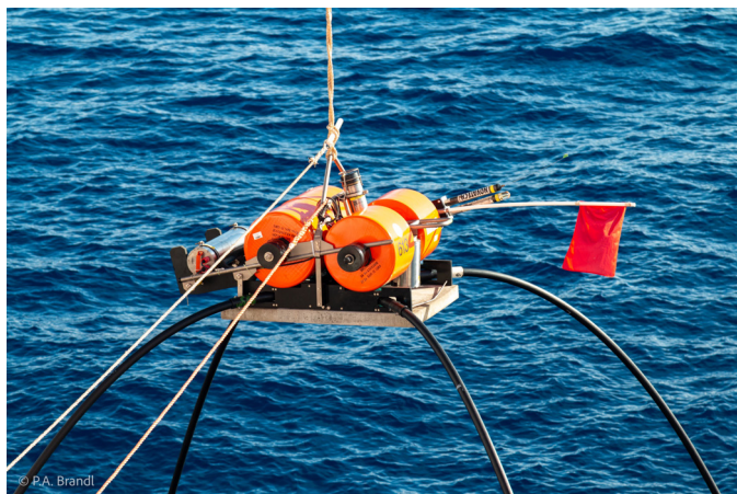
Deployment of an OBMT station.

From Sunday, 11 June, to Monday, 12 June, we crossed the Solomon Sea but were unable to collect any hydroacoustic data due to the fact that our research permit has unfortunately still not been confirmed formally. This is a pity as the seafloor of this 35-41 million year old backarc basin has hardly been mapped previously. On Tuesday afternoon we finally reached our actual working area and after many phone calls and emails we finally and very timely received the long-awaited confirmation of our research permit at around 2 pm. Big thanks at this point to the team at the German Embassy in Canberra, Australia, and the German Research Vessel Coordination Centre (LDF) for their efforts in this matter.