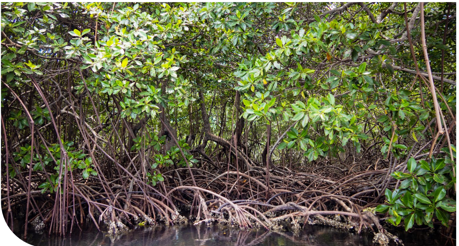
Mangrove forest (Rhizophora) on the coast of Barú Peninsula (Colombia).

However, there is still no societal consensus on how high possible residual emissions may be and which sectors may cause them. At present, residual emissions, for example in cement production, air and heavy-duty transport, and also agriculture and waste incineration, are residual. To compensate for the residual emissions, humankind will have to remove the same amount of carbon dioxide from the atmosphere.