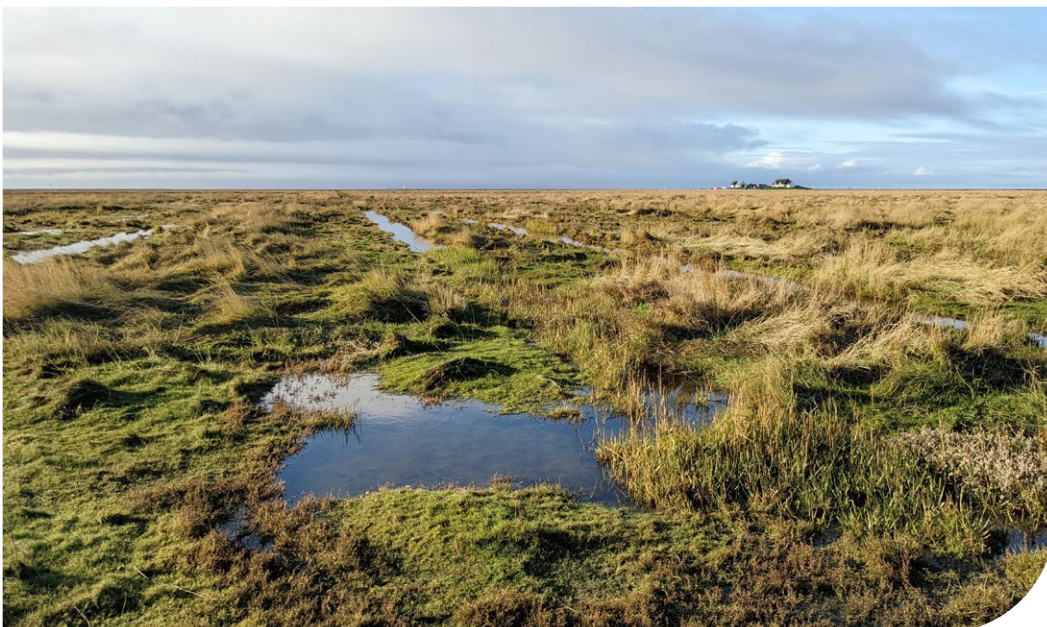
Salt marshes, Hamburg Hallig.

Based on the basic research carried out in CDRmare, the experts want to develop innovative methods for expanding the area of coastal vegetated ecosystems as well as political recommendations for action with which the carbon dioxide uptake of marine meadows and forests could be increased in an environmentally compatible and socially acceptable way - on German coasts as well as worldwide.