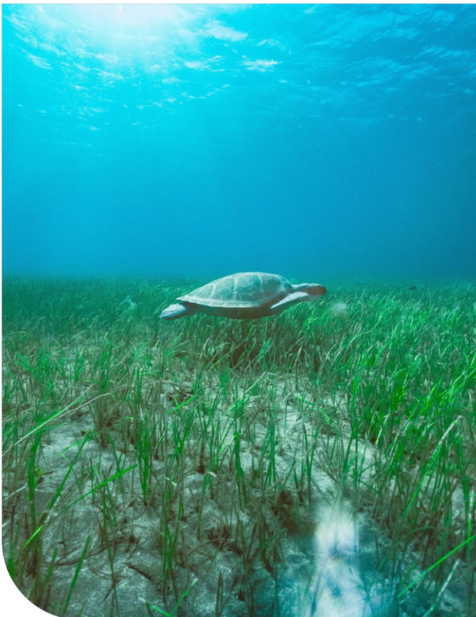
A green sea turtle explores a seagrass bed off the coast of Tenerife coast.

Their measurement data also flows into computer models that simulate a large-scale expansion of coastal ecosystems. In the process, the researchers investigate how stable and adaptable the biotic communities and their carbon stores would be under different climate conditions. They also examine the extent to which the biodiversity and additional benefits of marine meadows and forests would increase if they were to grow over a significantly larger area than they do today. They also analyse what negative consequences an increase in area could have.