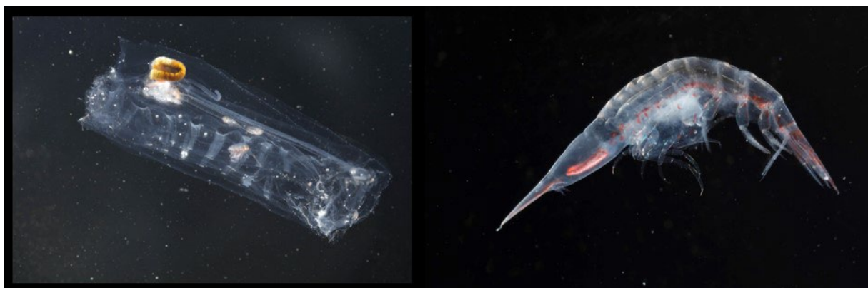
Figure 2 Two members of the “midwater world” around Madeira caught during plankton sampling on station RID-D1. Left: the salp Salpa fusiformes ; right: the amphipod Streetsia spec.