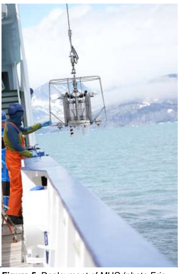
Figure 5. Deployment of MUC

we find older material, which we can use to answer questions such as: How did the retreat of glaciers in the past affect the species living in the fjords?