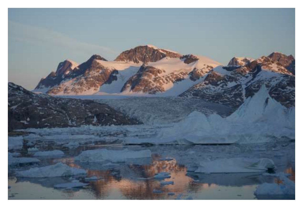
Figure 3. Glacier in Mogens Heinesens Fjord

We now finished our work in Mogens Heinesens Fjord and making our way up north along the east Greenland coast towards Sermilik Fjord, which we will reach in 2 days time.