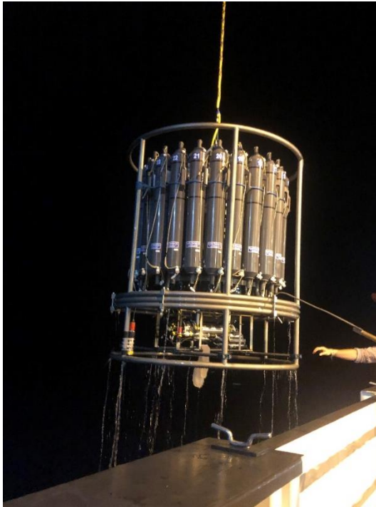
Fig. 2. Titanium CTD frame comes on deck on RV SONNE.

The GEOTRACES research cruise SO308 is one week underway, and we are now sampling at station 12 (Fig. 1), in the middle of the Mozambique Channel and in the French exclusive economic zone. Over the last 7 days we have sampled shelf and slope stations along the Mozambique coast