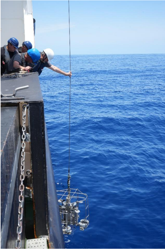
Fig. 3: Mini MUC hanging on crane, before attachment to CTD frame.

of 800 m for particle collection and radium isotope sampling. At the superstations we spend up to 9 to 12 hours. Dominik Jasinski, Thorsten Schott and Anton Theileis are working hard every day in deploying the CTDs, camera systems and in situ pumps.