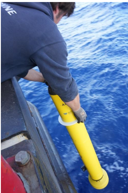
Fig. 4: ARGO float deployment from RV SONNE.

One of our regular activities on the cruise will be the deployment of ARGO floats. We have a total of 19 floats to deploy, from the US and German ARGO communities. The float are the standard ARGO units with temperature, salinity, oxygen and fluorescence sensor, but also biogeochemical floats with additional nitrate, pH, suspended particle and irradiance sensors. At station 11, we deployed the first US Argo float (Fig. 4) which will add to the global array of more than 15000 deployed floats that will sample the ocean down to 2000 m.